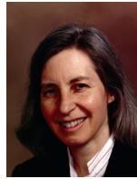
Martha L. Minow, Keynote Speaker Jeremiah Smith, Jr. Professor of Law Harvard Law School